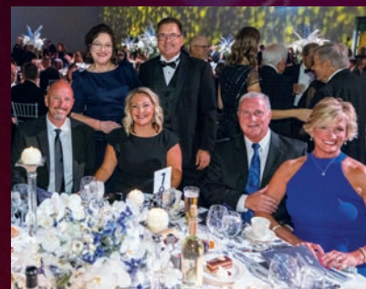
Diamond Sponsors Huntington Bank.