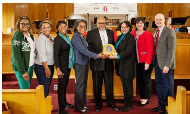
On April 6, a plaque was dedicated in the Dr. Gary B. and Pamela S. Williams Center for Breast Health that recognizes the longtime generosity of the Kent Area (OH) Chapter, The Links, Incorporated.