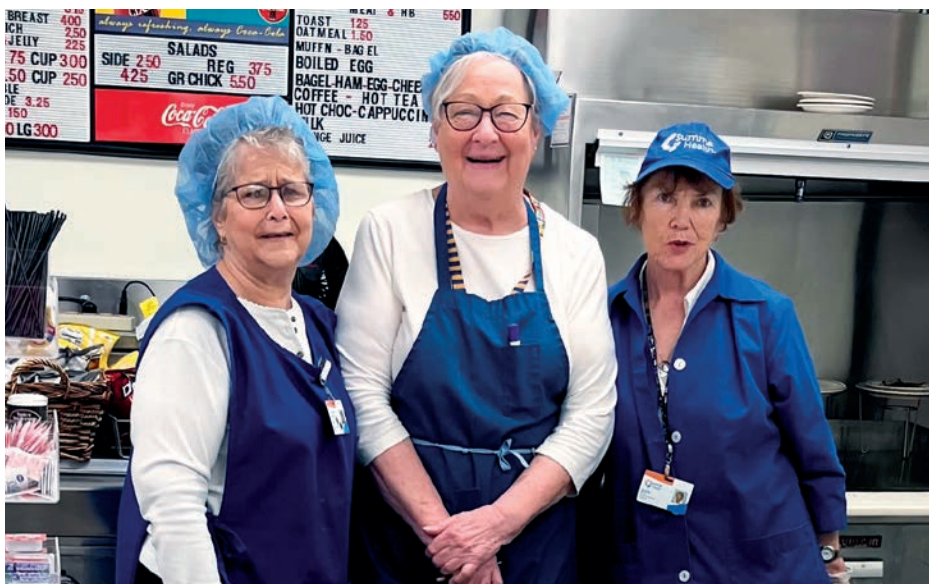
Members of the Wadsworth-Rittman Hospital Auxiliary are shown here volunteering at the snack bar.