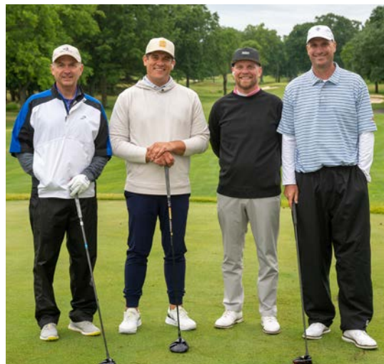
SeibertKeck Insurance Agency won first place for the second consecutive year.