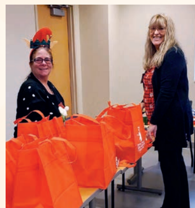
Summa Health staff and volunteers brighten the holidays.