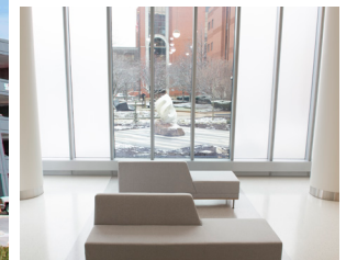
The Reflection Center

Summa Health invites visitors to celebrate the place that recognized and revolutionized the treatment for alcoholism throughout the world.