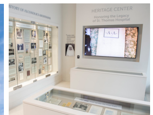
The Heritage Center